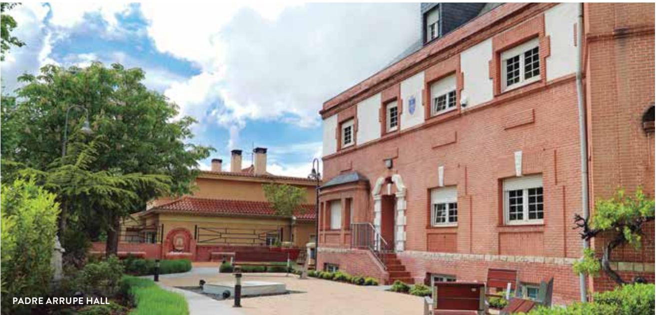
PADRE ARRUPE HALL