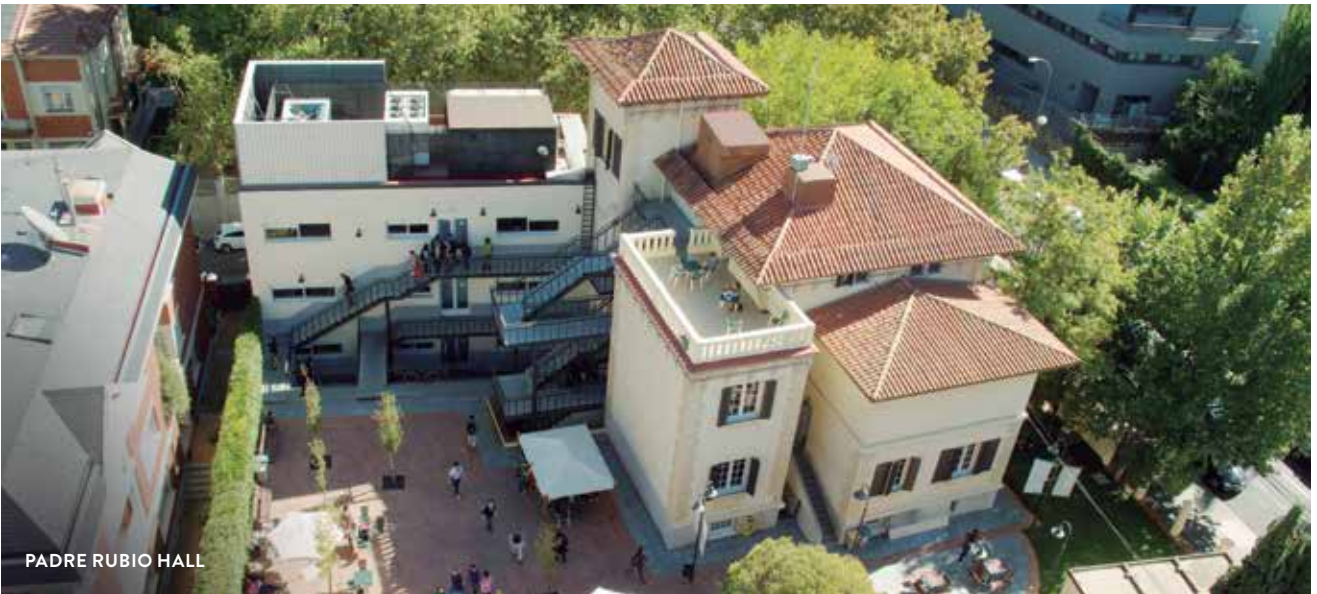
PADRE RUBIO HALL