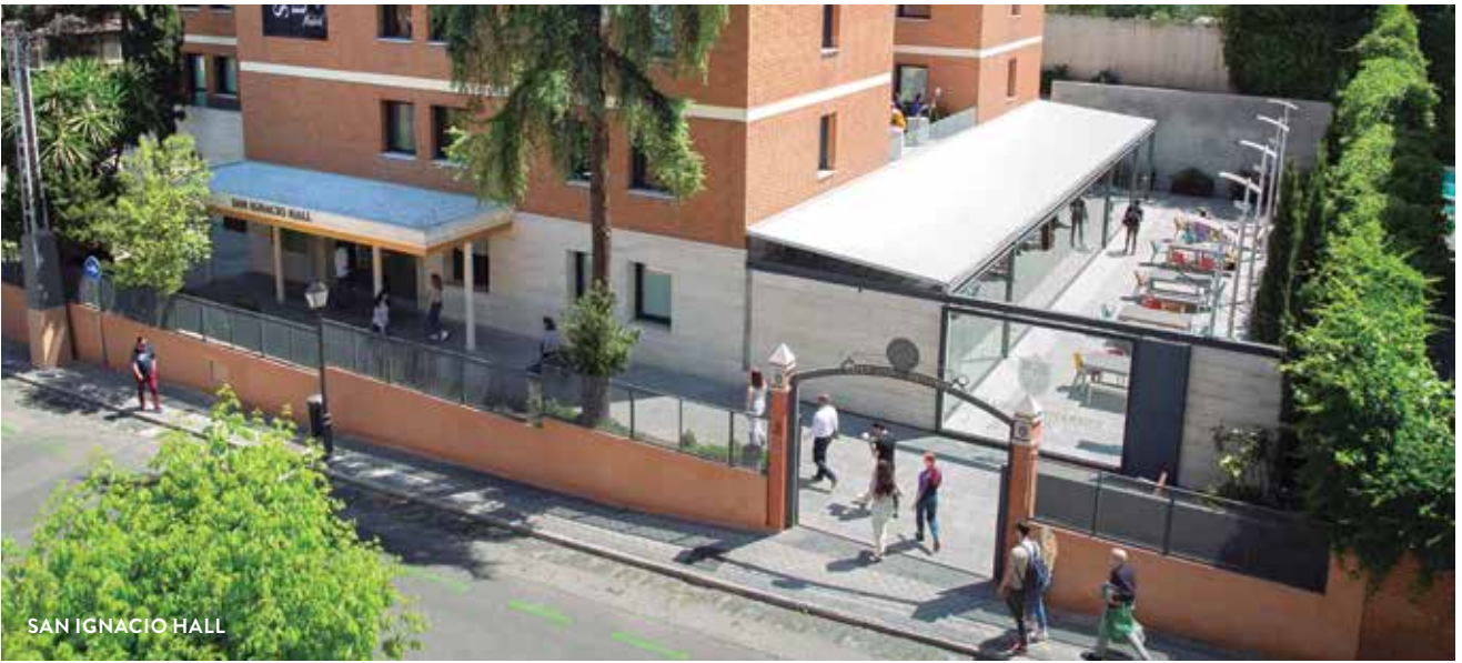
SAN IGNACIO HALL